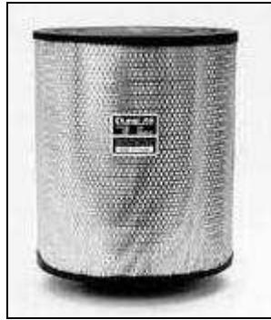
Above left: ECB style