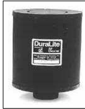
Above right: ECC style

Disposable, small, lightweight and in the case of the ECC, unitised. For 2-3 cylinder, high vibration engines. Can be vertically or horizontally mounted.