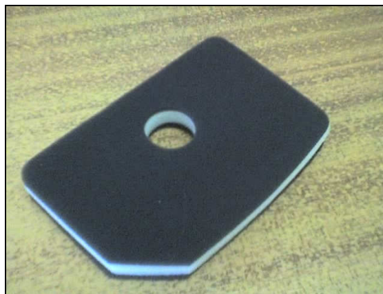
Above: SA22126 foam filter for a Stihl cutter

Replacement pre-filters and filters for Makita, Partner, Husqvarna, Dolmar & Kango power & hand tools also available on request.