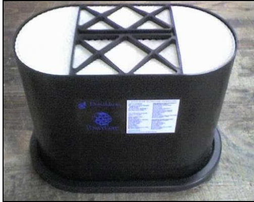
Above P60 8533 Primary Element